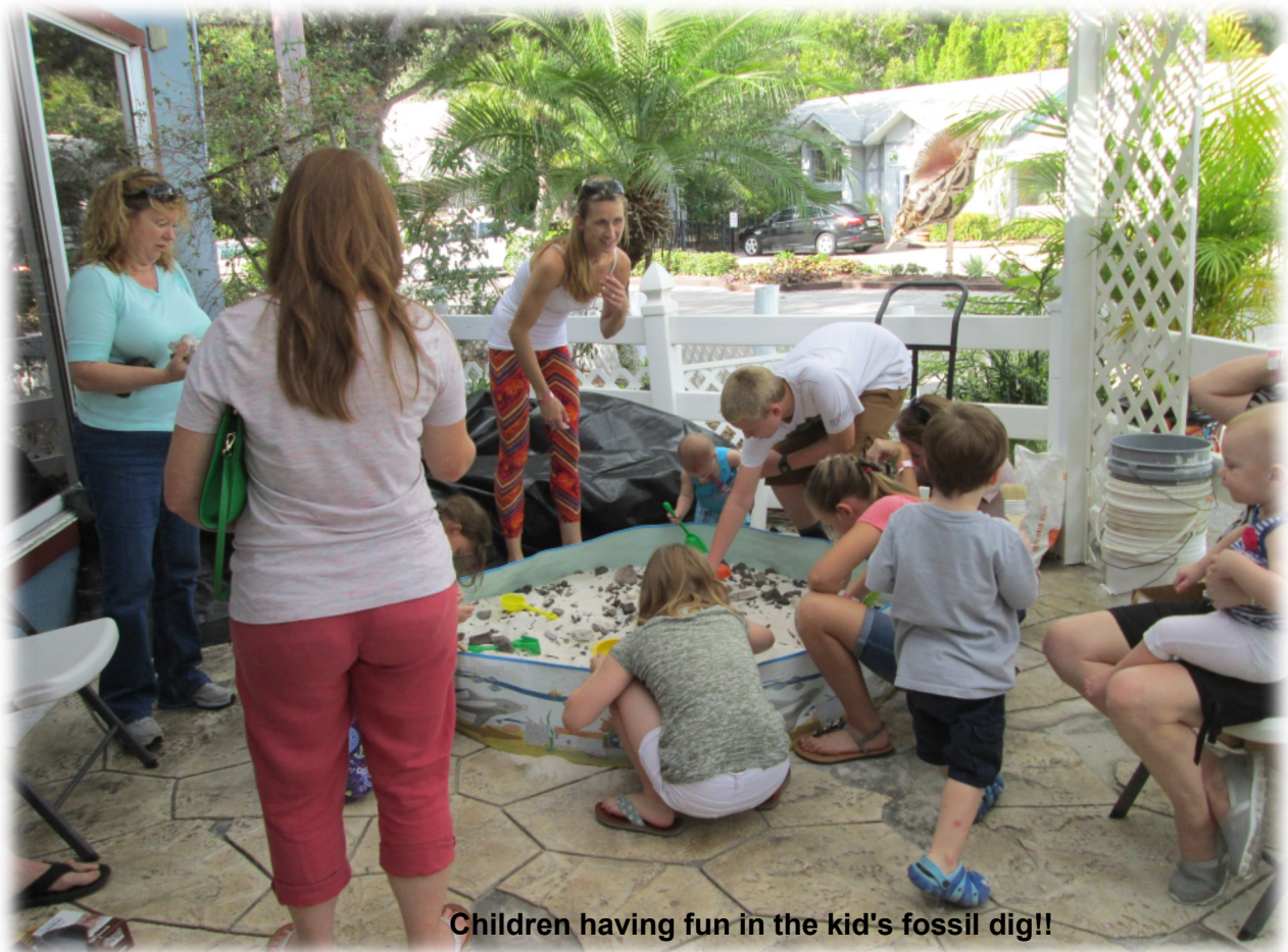
Children having fun in the kid's fossil dig!!