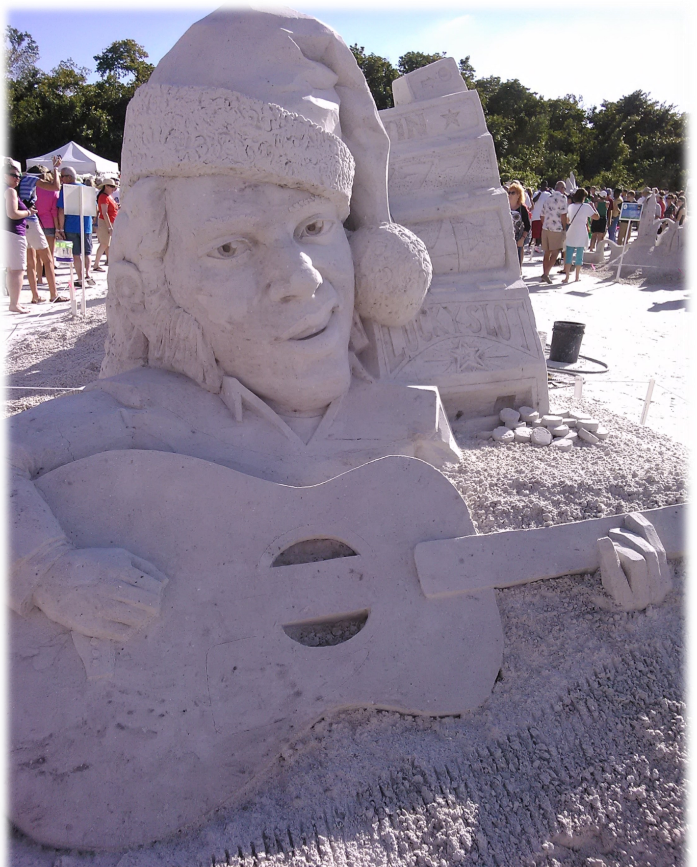
MERRY CHRISTMAS!! With an absence of snow, we use sand! From the annual sand sculpting contest at Ft Myers Beach, 2014.