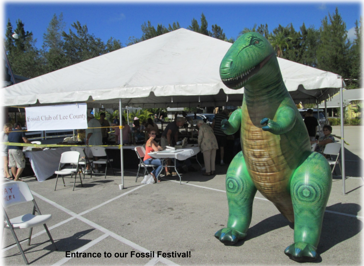
Entrance to our Fossil Festival!

We have not, at this time, had final accounting, but we hope to have made enough money to jumpstart our scholarship fund. The other big fundraiser for us, the annual fossil auction, in March, helps determine how many scholarships we can do for the year. So, the club thanks all the people involved: members, dealers, organizers, and the Shell Factory for their huge help!