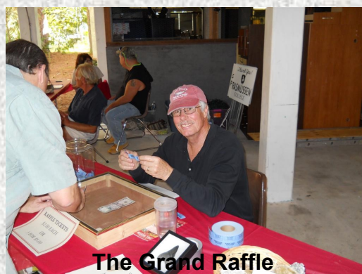
The Grand Raffle

We distribute our club newsletter to all of our members and a host of others including vendors, schools, the Calusa Nature Center, the Imaginarium Science Center, the Bailey-Matthews Shell Museum, the Southwest Florida Gem and Mineral Club, and other organizations and friends of our club. So to all of our newsletter readers, we say thank you for supporting our show.