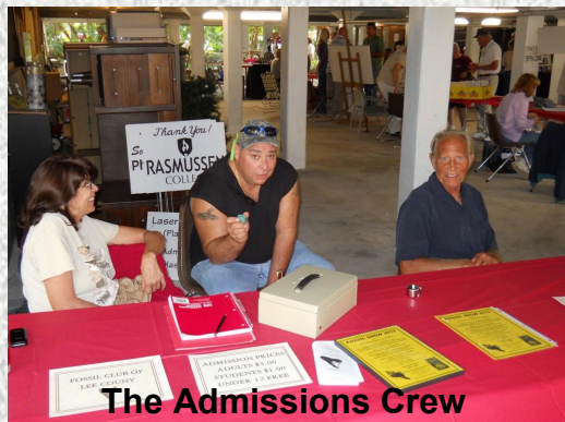
The Admissions Crew

From all indications, this was the best show yet! We had higher attendance, realized more income, pleased a lot of our vendors, and most certainly pleased more children (fossil enthusiasts in the making) than ever before. We will announce the financial breakdowns and related stats at the December 20th Dinner Meeting.