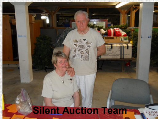
Silent Auction Team

From all indications, this was the best show yet! We had higher attendance, realized more income, pleased a lot of our vendors, and most certainly pleased more children (fossil enthusiasts in the making) than ever before. We will announce the financial breakdowns and related stats at the December 20th Dinner Meeting.