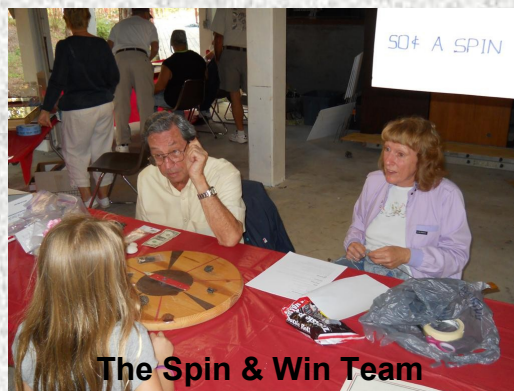
The Spin & Win Team

Putting on a Show of this magnitude takes a lot planning and a lot of execution. Every member can be proud of their contributions that went into making this a great event for our community. So let's congratulate each other and bask in the short lived moments of greatness. (Our next big event is just a few months away when we hold our Annual Auction on the third Thursday of March 2013.)