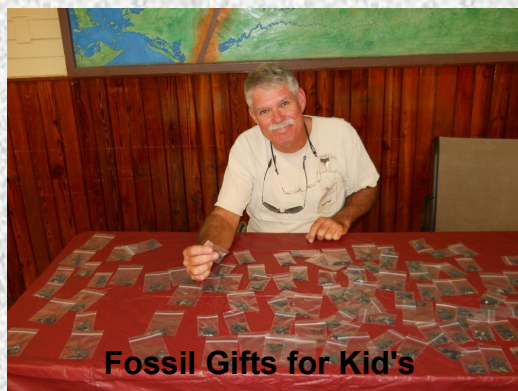
Fossil Gifts for Kid's

Putting on a Show of this magnitude takes a lot planning and a lot of execution. Every member can be proud of their contributions that went into making this a great event for our community. So let's congratulate each other and bask in the short lived moments of greatness. (Our next big event is just a few months away when we hold our Annual Auction on the third Thursday of March 2013.)