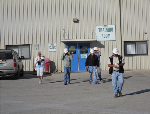
Ready to go Hunt!

We arrived at the Mosaic gate on time at 8:30 am and our host guided us to their training room for a briefing and orientation. There we learned about the geology of the area and a whole lot about phosphate mining. Everyone was quite interested and at the same time eager to go on a guided fossil hunt. The next step was to issue 30 hard hats and safety glasses.