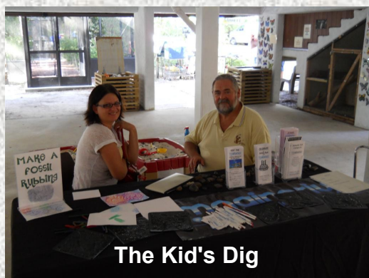
The Kid's Dig

We distribute our club newsletter to all of our members and a host of others including vendors, schools, the Calusa Nature Center, the Imaginarium Science Center, the Bailey-Matthews Shell Museum, the Southwest Florida Gem and Mineral Club, and other organizations and friends of our club. So to all of our newsletter readers, we say thank you for supporting our show.