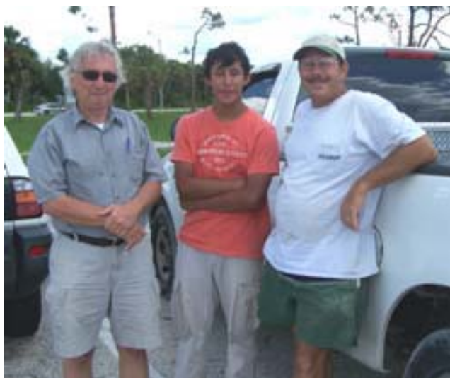
The hunt is over and everyone is tired.