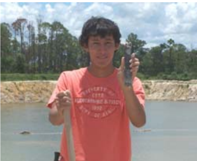
A horse leg bone in beautiful condition.