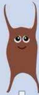
SPOTTED RAY Raja montagui