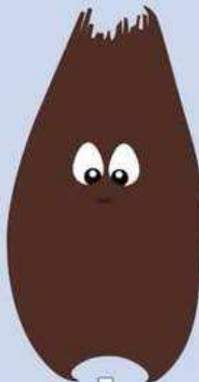
FLAPPER SKATE Dipturus intermedius