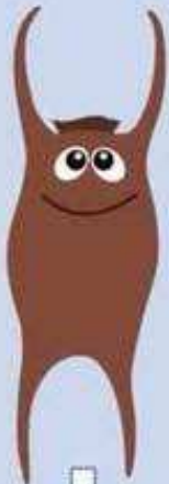
UNDULATE RAY Raja undulata