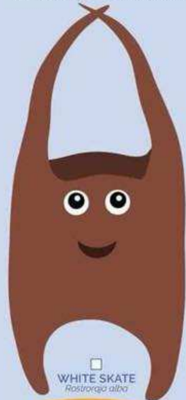
WHITE SKATE Rostroraja alba