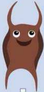
THORNBACK RAY Raja clavata