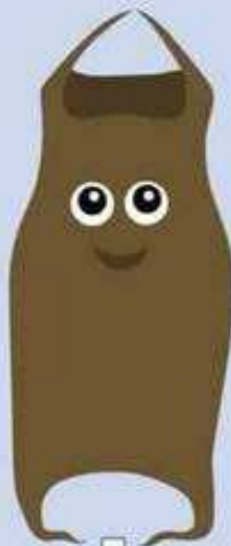
BLUE SKATE Dipturus batis