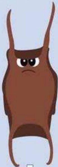
BLONDE RAY Raja brachyura