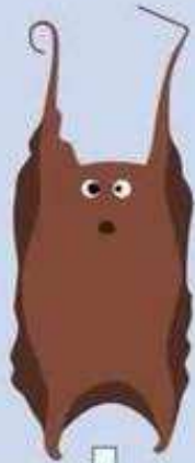
SMALL-EYED RAY Raja microocellata