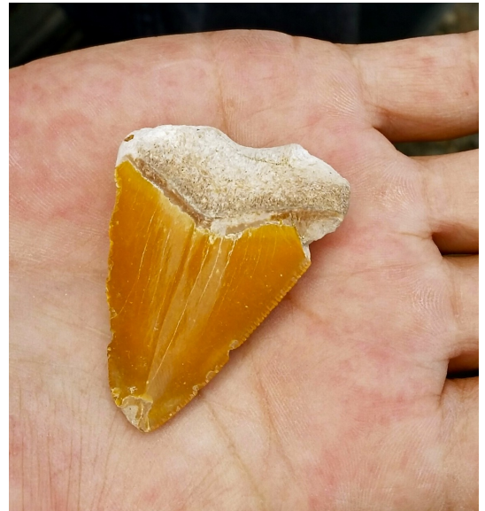
So close and yet so far: Mike Cox found this beat up meg with amazing color