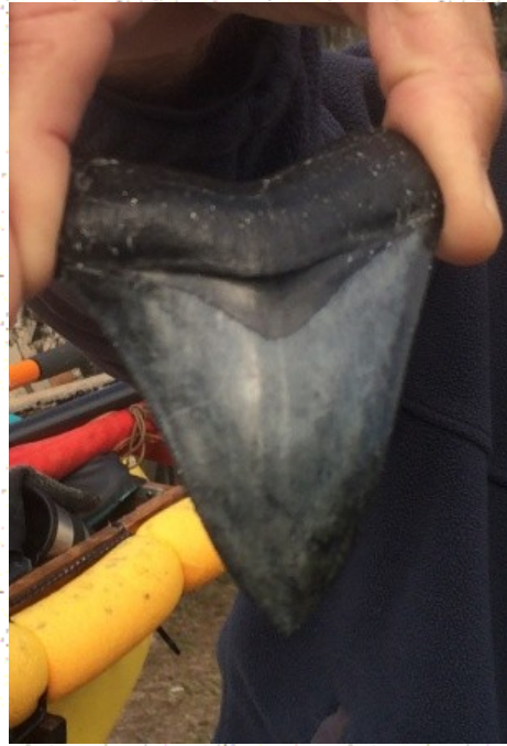
Fossil: Gulf of Mexico Megalodon