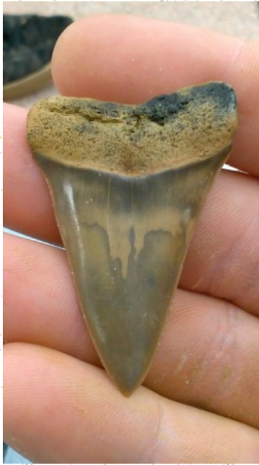
Fossil: Caloosahatchee River Mako