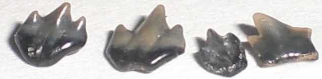
Nurse shark teeth